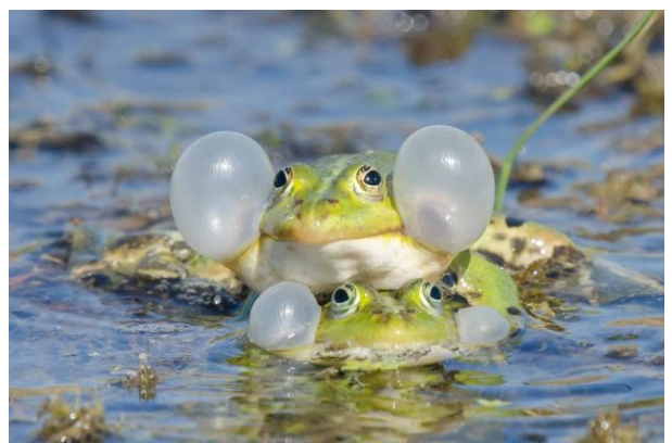
From top: Capercaillie, Slavonian Grebe, Edible Frogs